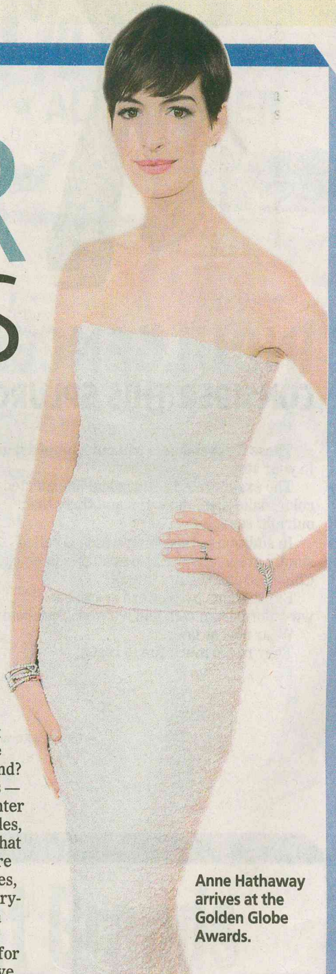
Anne Hathaway arrives at the Golden Globe Awards.